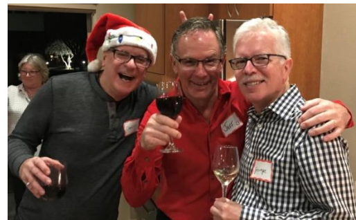
2017 Holiday Pot Luck

6:00 PM Main Entrée provided. Bring a side dish to share.