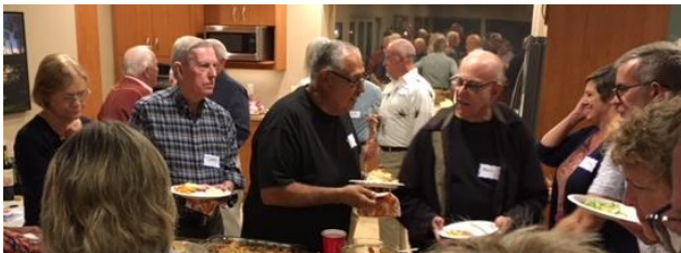
An amply laden buffet ensured a good time was had by all and all went home with full tummies.