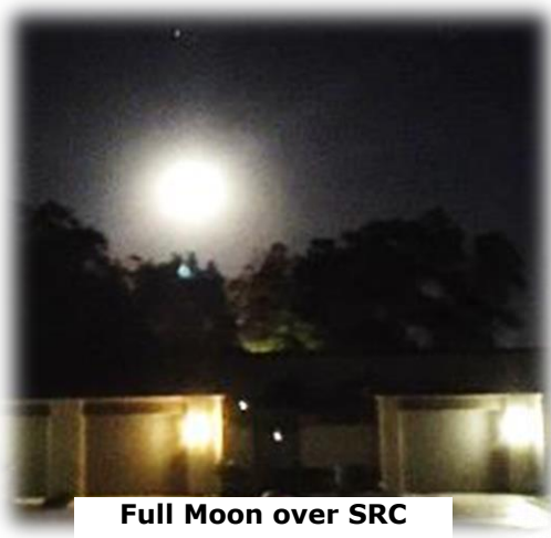
Full Moon over SRC